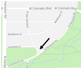
Stevens Park Estates