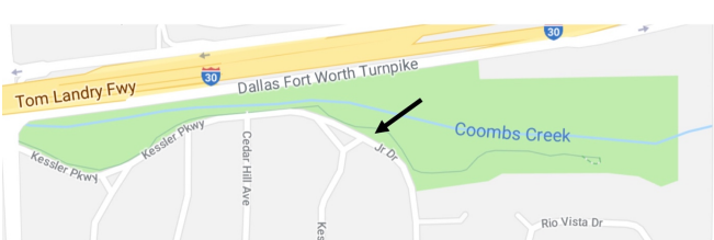
East Kessler Park